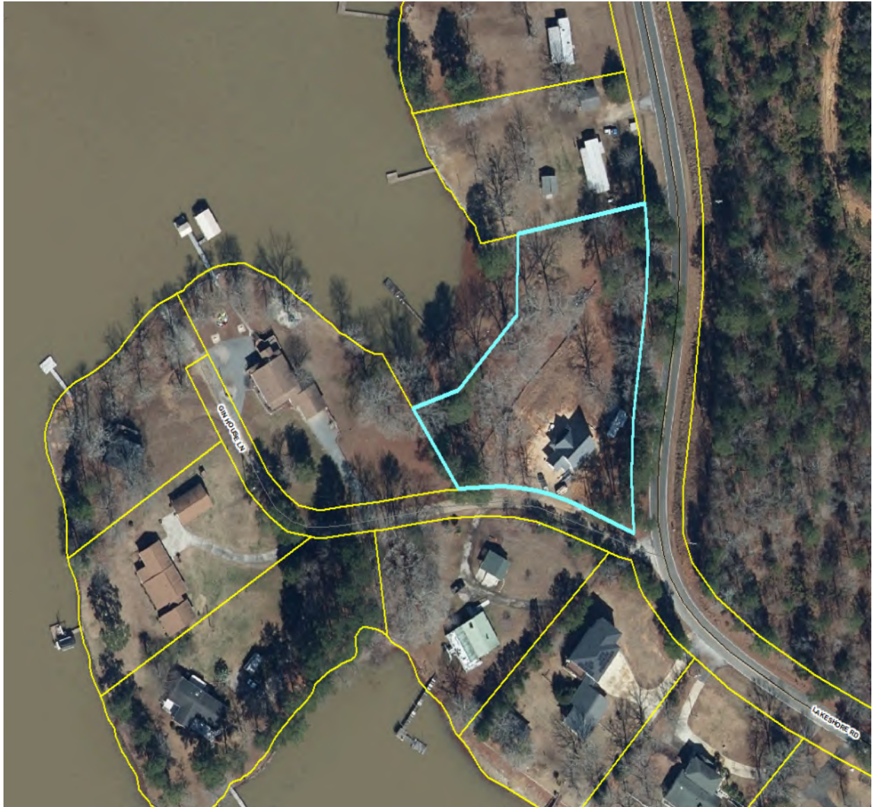
Aerial view of subject property outlined in blue color (BZA# 25-01)